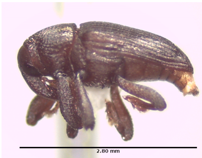
Fig. 1. Adult weevil.