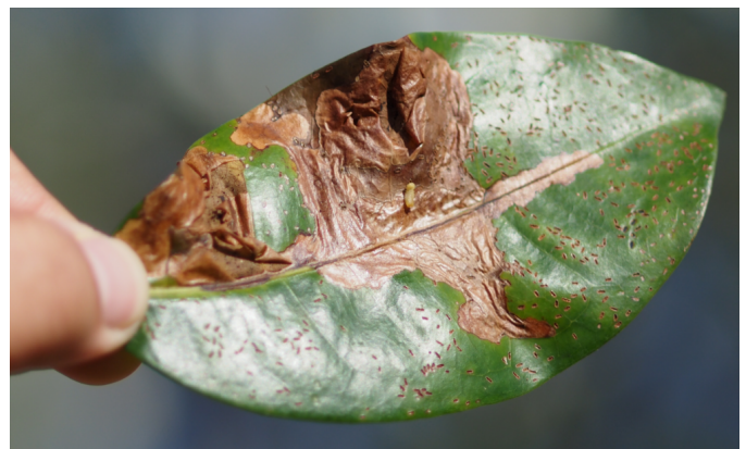
Fig. 3. Feeding damage: leaf mine in an Ixora leaf.