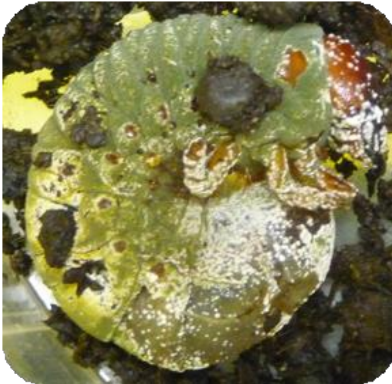
Figure 6: Male coconut rhinoceros beetle.

Guam Invasive Species Hotline 475-PEST (475-7378)