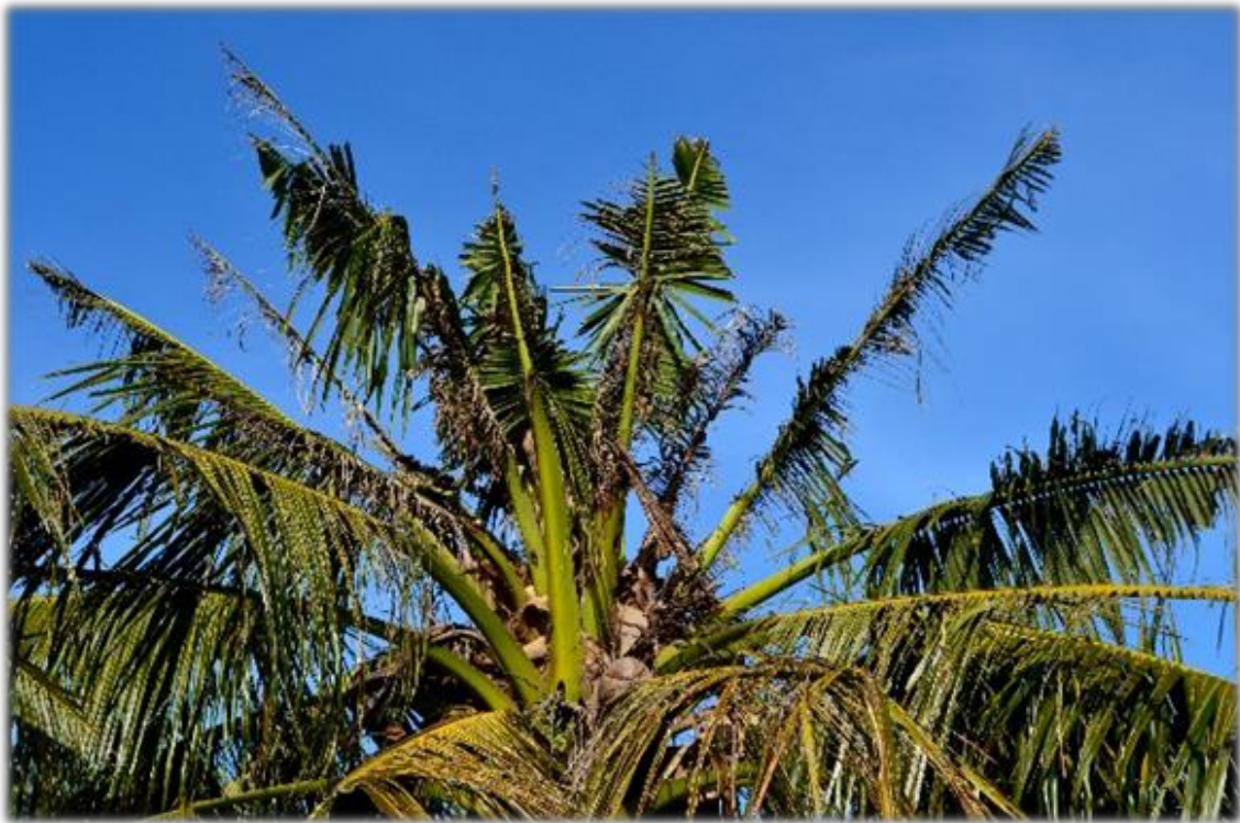
Figure 4: Coconut leaves damaged by coconut rhinoceros beetles.