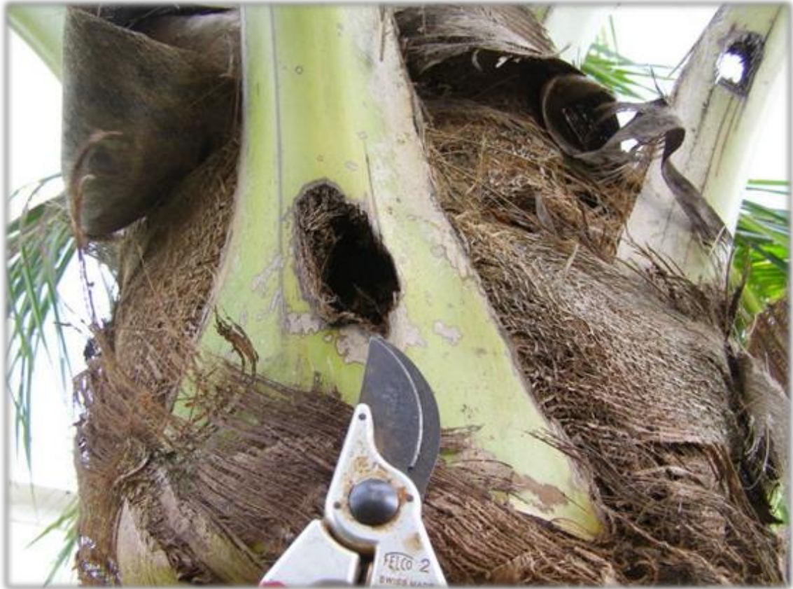
Figure 5: Coconut rhinoceros beetle bore hole through a coconut petiole.