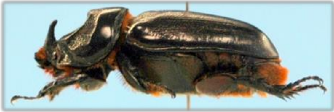
Figure 2: Female coconut rhinoceros beetle.