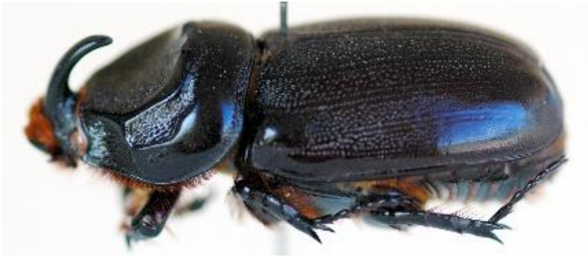
Figure 3: Male coconut rhinoceros beetle.